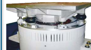
Guided head expander THS 80-440

Apart from the range of standard head expanders TIRA also offers customized fixtures for round, square or rectangular working areas.